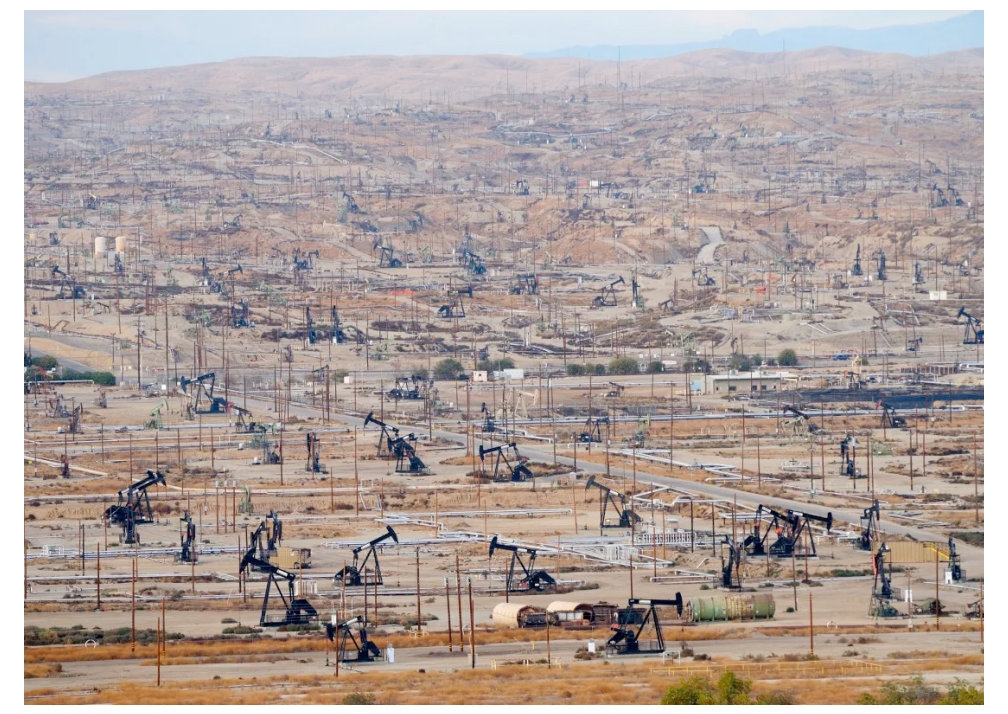
Oil field in Bakersfield.

But I'm not the only one who faces the impact of the climate crisis every day. Thousands of Californians, many BIPOC – Black, Indigenous, People of Color – struggle to breathe every day, whether it's due to breathing in ash from wildfires or breathing polluted air.